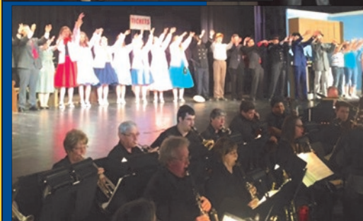
Talented CC Sr. HS students performing in the play Bye Bye Birdie