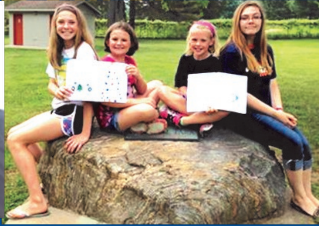
Columbia Central Jr. High School Scientists and Writing Students with their Third Grade Writing Partners